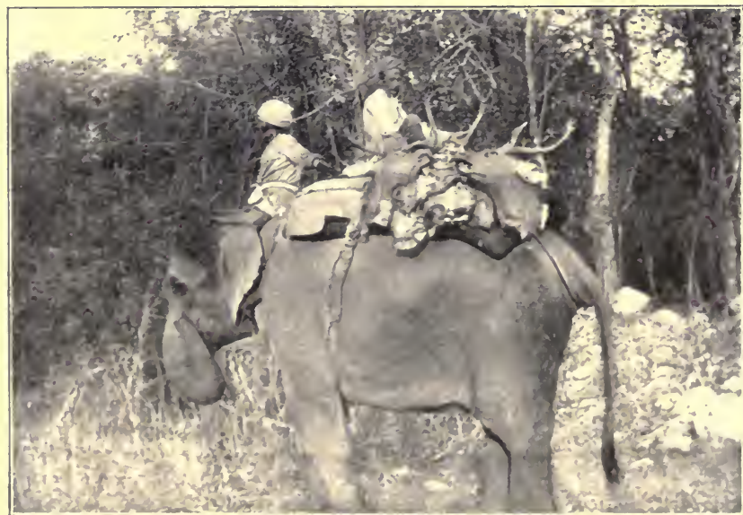
BRINGING HOME THE BAG.